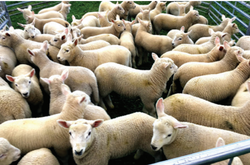
Hogget lambs at tailing (16 th November 2021). Sired by 50% Beltex, 50% Cheviot rams over Perendale Ewe Hoggets. These started lambing in the first week of October