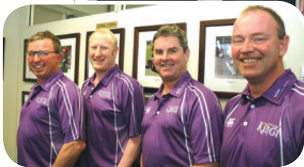
Modelling the Canterbury Kings shirts with HIB branding on the collars.