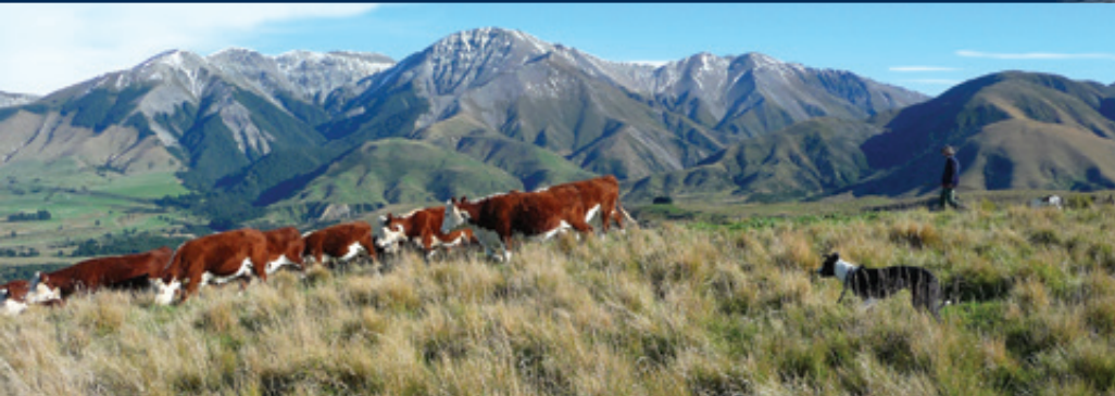
Hereford cows at the Whalesback, looking towards Mount Lyford and Mount Terako.